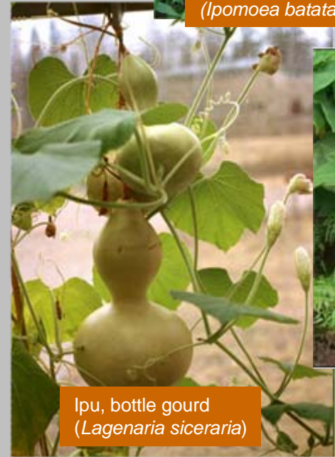
Ipu, bottle gourd ( Lagenaria siceraria )

E komo mai - welcome - to Nu`alolo Kai. Please enjoy the native and Polynesian-introduced plants in our goat-free enclosure. We feature species that grow nearby today - or once did. Many of these also occur in the archaeological sites here, as artifacts, food items, and subfossil seeds or charcoal.