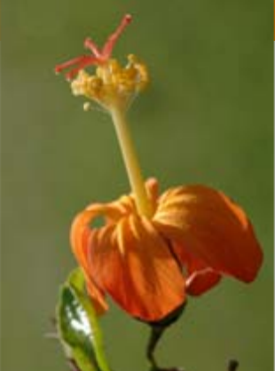
Koki`o`ula ( Hibiscus kokiostjohnianus ) is a rare and beautiful shrub of the highlands above Nu`alolo Kai.