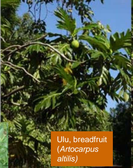
Ulu, breadfruit ( Artocarpus altilis )