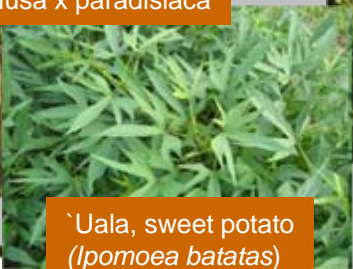
`Uala, sweet potato ( Ipomoea batatas )

Food plants important at Nu`alolo Kai that were brought to Hawaii by Polynesian colonizers.