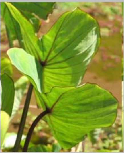
Kalo or taro ( Colocasia esculenta ) was a key part of the traditional diet. Look for it in the small wetland, or lo'i in the heiau.