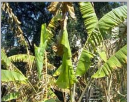
Mai`a, or banana ( Musa x paradisiaca )